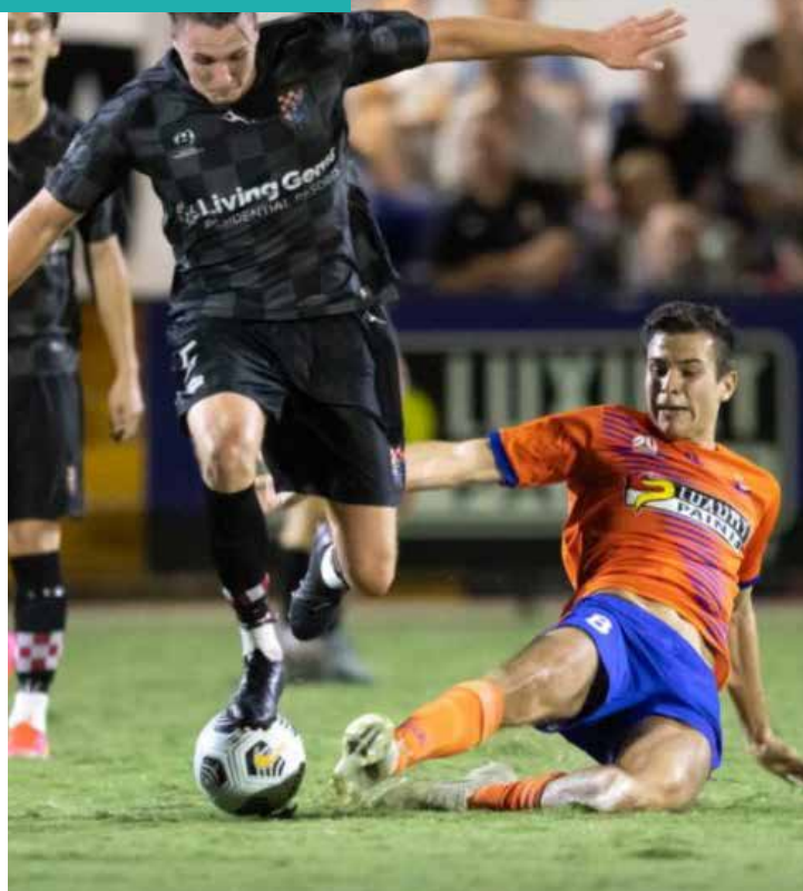
The Gold Coast Knights Easter Skills Acquisition Phase Clinic will be coming to Bundaberg soon, run by the teams coaches.